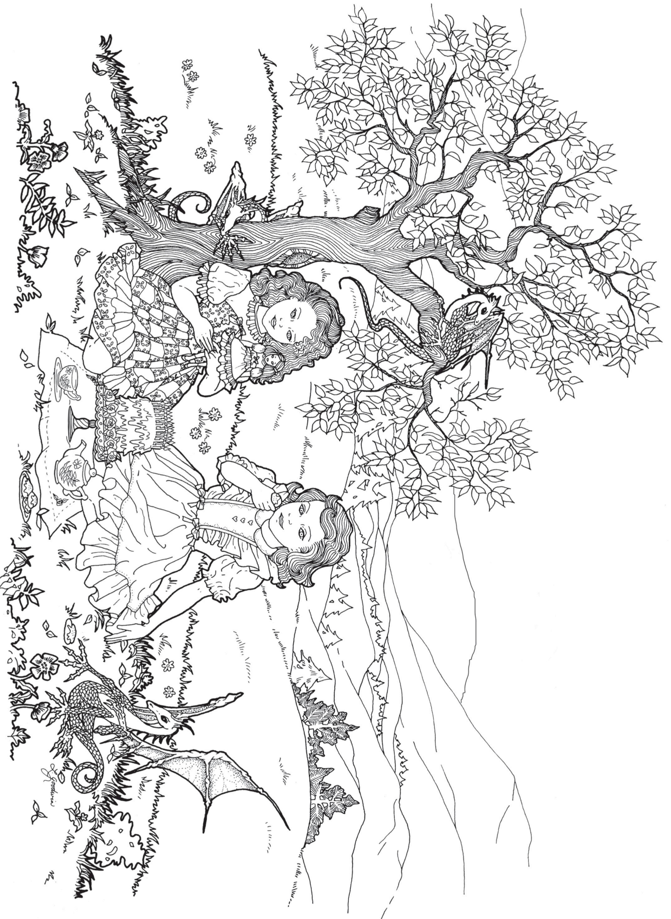
"The Birthday Party" by Lynne Goodwin